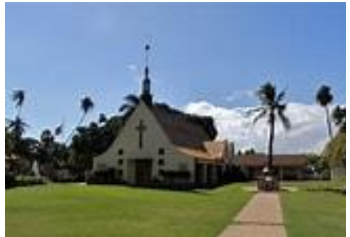
The historic Waiola UCC Church in Lahaina